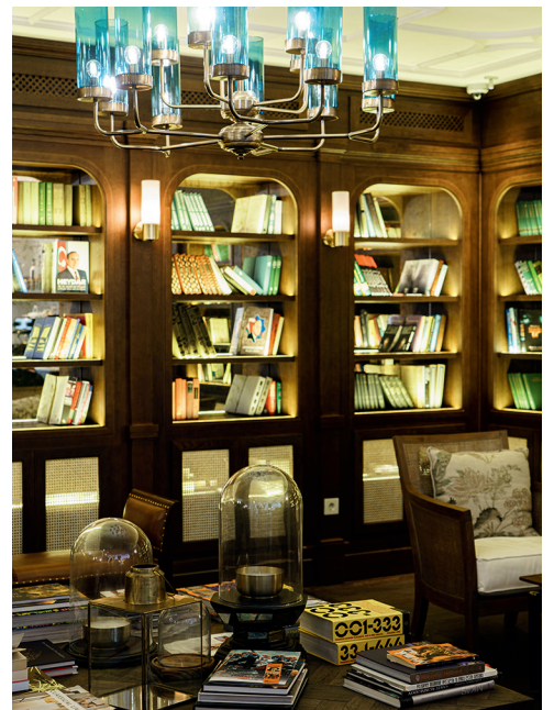
Top row, from left: Chelebi; The Anjir; Azerkhalcha. Middle row, from left: Soreka; the café at Gazelli House; cushions at Chelebi. Bottom row, from left: Abad; Resm; Gazelli House's library lounge